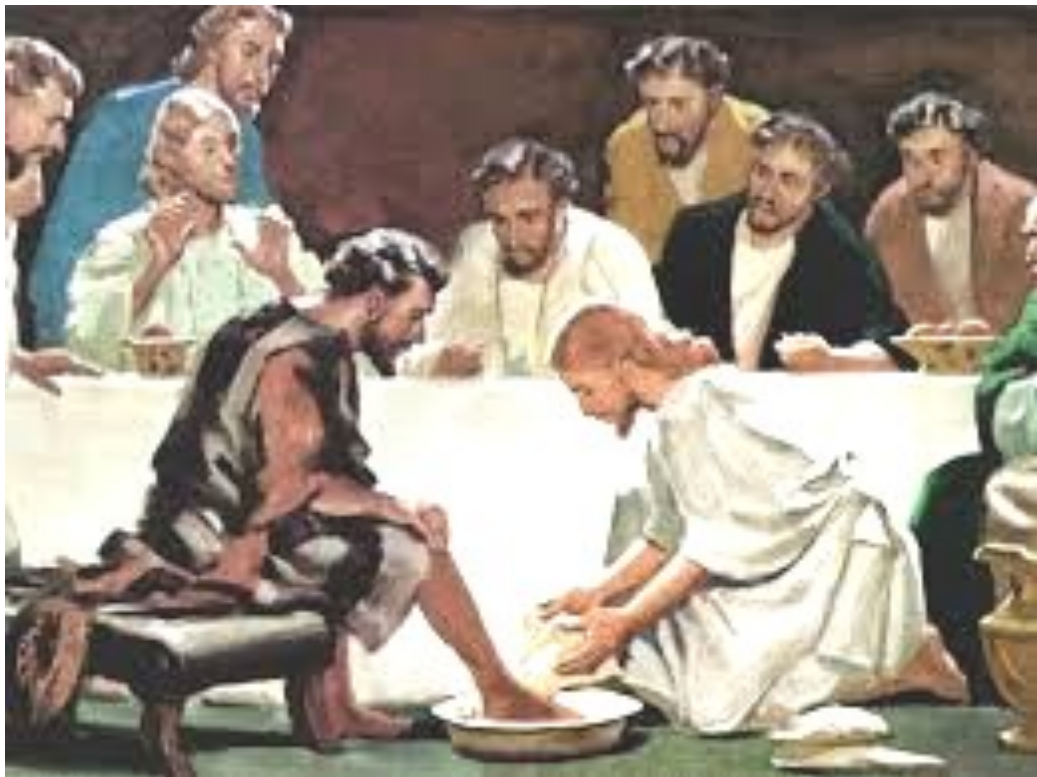
Jesus washes the feet of his disciples

Church News and Views for the Parishes of Badingham Bruisyard Cransford Dennington Rendham & Sweffling