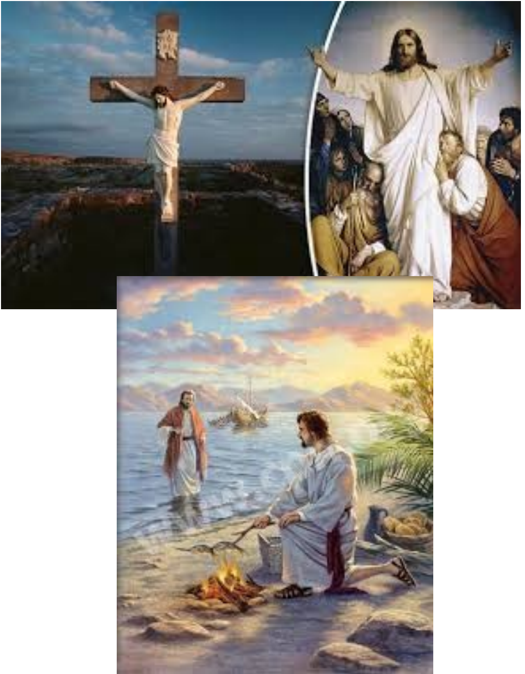
The First Christian BarBeQue with the Risen Lord