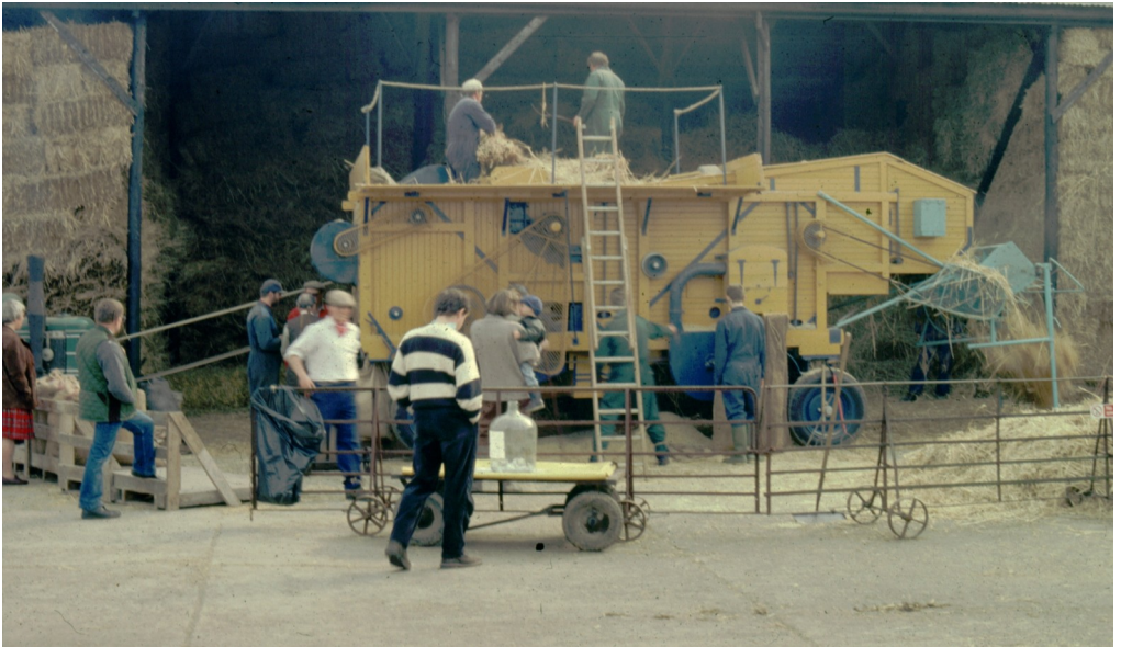
Threshing the thatching straw at Red Barn Farm